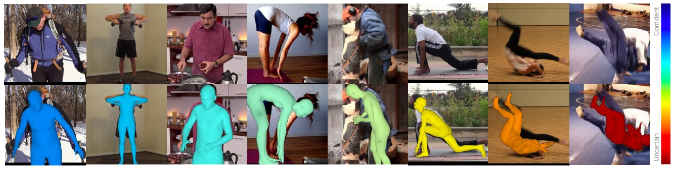
Figure 1. Regressing 3D humans and confidence. Most existing methods that regress 3D Human Pose and Shape (HPS) do not report their confidence (or uncertainty). An estimate of confidence, however, is needed by methods that "consume" the results of HPS. Even the best HPS methods struggle when the image evidence is weak or ambiguous. Our framework, POCO, extends existing HPS regressors to also estimate uncertainty in a single forward pass. The confidence (color-coded on the body) is correlated with the pose quality.

<sup>1</sup>Max Planck Institute for Intelligent Systems, Tübingen, Germany <sup>2</sup>Inria, École normale supérieure, CNRS, PSL Research University, France <sup>3</sup>University of Amsterdam, the Netherlands