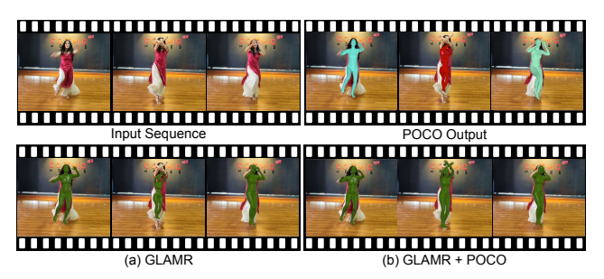
Figure 4. Infilling with uncertainty. Given estimated 3D bodies for detected people in a video, GLAMR [70] infills 3D bodies for missing detections, and does sequence-level refinement for these. (a) However, GLAMR considers all estimated 3D bodies as accurate, and fails when they are not. (b) POCO provides both 3D bodies and an uncertainty metric; this helps GLAMR reject uncertain bodies and infill also for these. See middle frame for a/b. For video results, see the video on our website.

that pseudo-GT contributes highly-varied images that improve HPS, but the strict uncertainty threshold contributes less-varied uncertainty labels. We also vary the uncertainty threshold and observe that for higher thresholds, the performance decreases, showing that higher uncertainty corresponds to low quality pseudo-GT; for details see Sup. Mat.