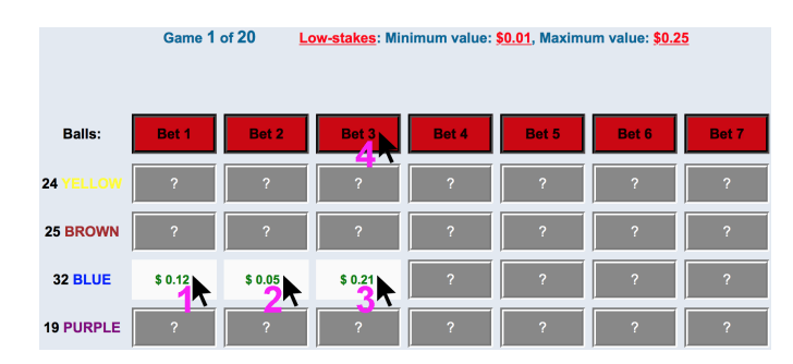
Figure 1: The Mouselab paradigm, showing an example sequence of clicks generated by the SAT-TTB strategy, which was discovered through approximate rational metareasoning.

or sequence of operations if and only if the resulting improvement in decision quality is larger than cost of those operations. Intuitively, this means that the decision process prescribed by our model achieves the optimal tradeoff between decision quality versus decision time and mental effort. This tradeoff depends on the stakes of the decision such that higher stakes usually warrant more deliberation. Likewise, since processing probable outcomes is more likely to improve the quality of the resulting decision than processing improbable outcomes, we expect our model to prioritize probable outcomes over less probable outcomes—especially in high-dispersion trials.